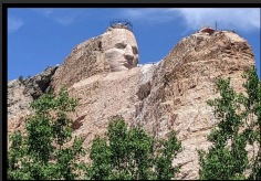
CRAZY HORSE MEMORIAL