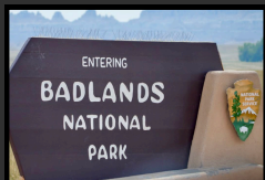
BADLANDS NATIONAL PARK